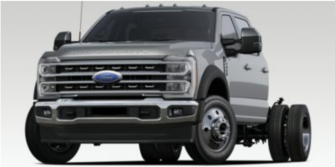
Note:Photo may not represent exact vehicle or selected equipment.

Vehicle: [Fleet] 2023 Ford Super Duty F-450 DRW (W4G) XL 2WD Crew Cab 203" WB 84" CA (✔ Complete )